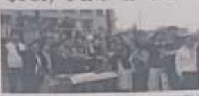
बाइट फिएस्ट में भाग ले रहे छात्रों का एक समूह।

अम्ब में आयोजित 'बाइट फिएस्ट' का उद्देश्य छात्रों को तकनीकी क्षेत्र में रुचि दिलाना और उनके कौशल को बढ़ावा देना है।