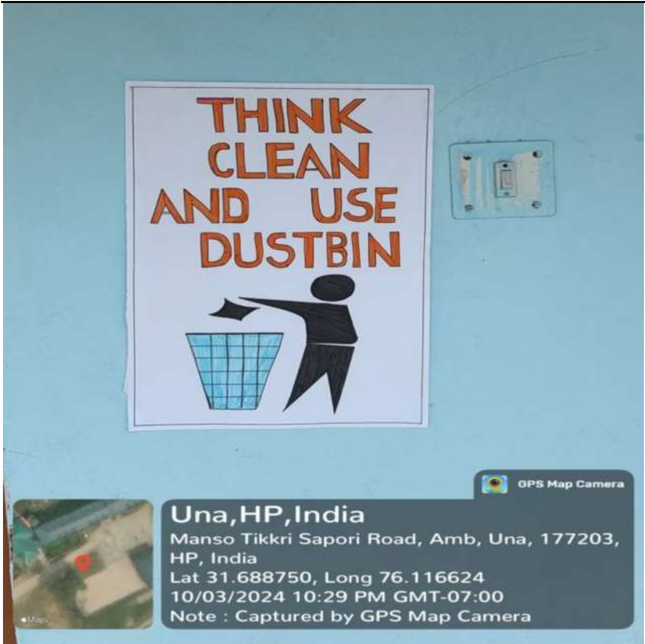
Posters displayed in the college campus