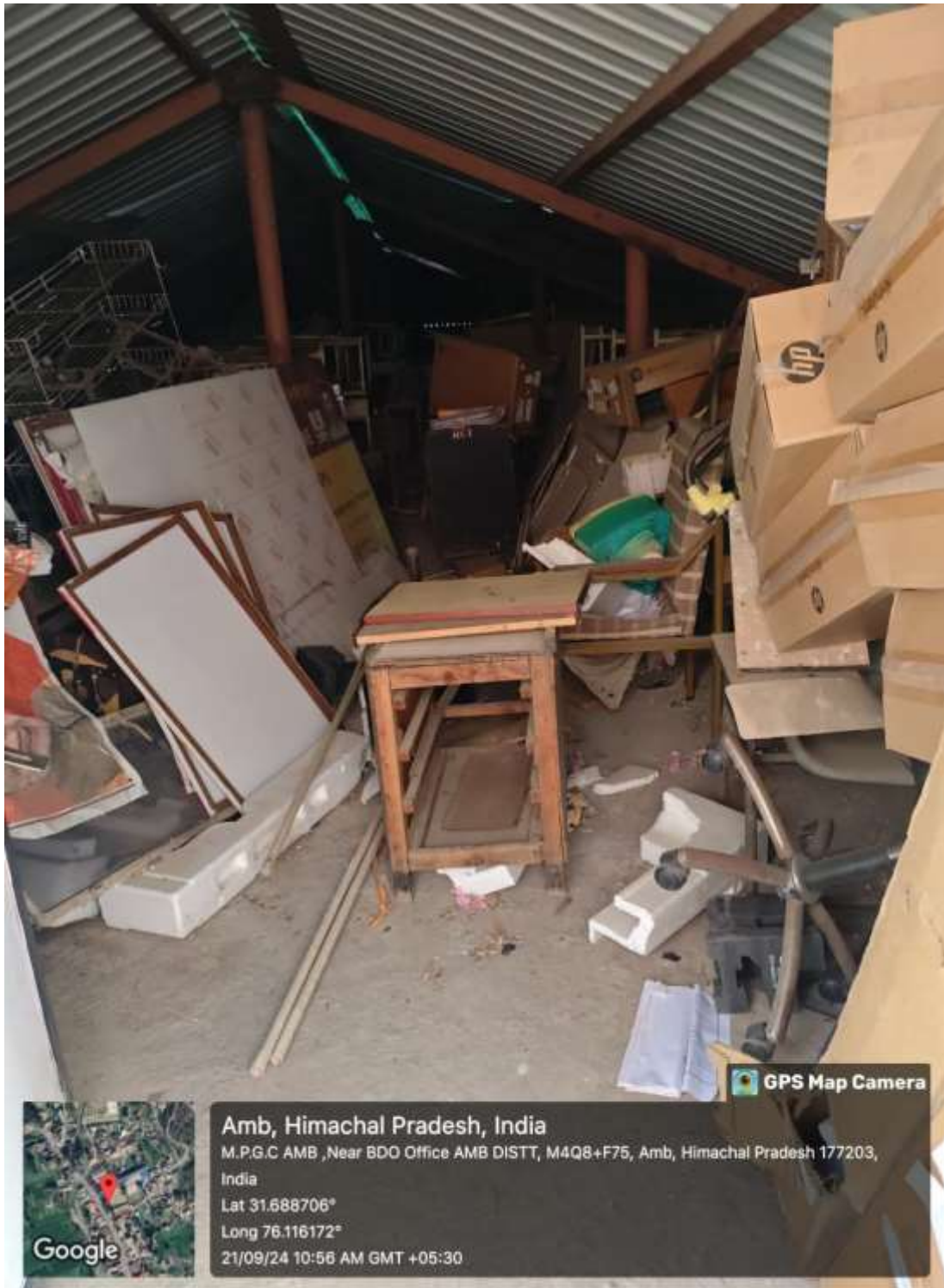
Photo of the-waste kept in a store for the purpose of dispose off