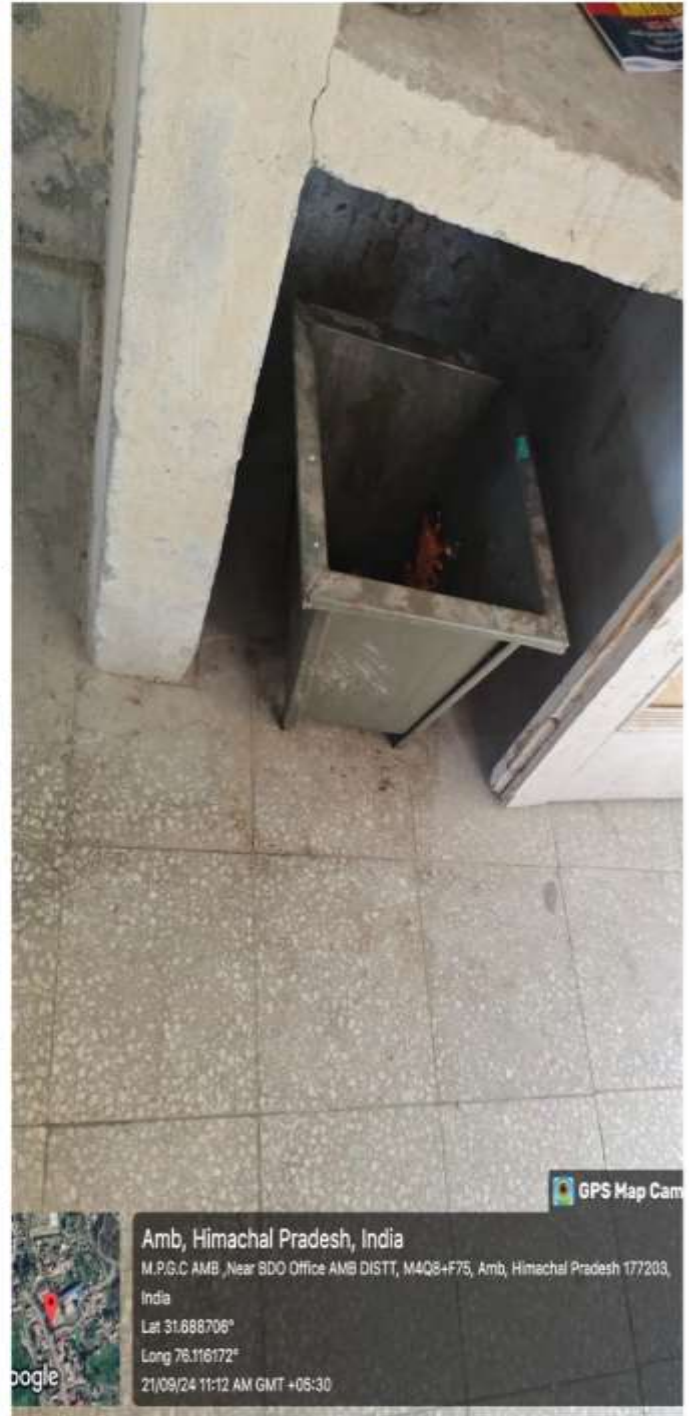
Photos of dustbins placed in classrooms