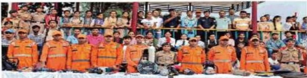
अम्ब कालेज में आपदा प्रबंधन के गुर सिखाने के दौरान 14वीं वाहिनी राष्ट्रीय आपदा मोचन बल नालागढ़ के अधिकारी

संवाद सहायिका, अम्ब : राजकीय उत्कृष्ट महाविद्यालय अंब में 14वीं वाहिनी राष्ट्रीय आपदा मोचन बल नालागढ़ ने वीरवार को विद्यार्थियों को आपदा के